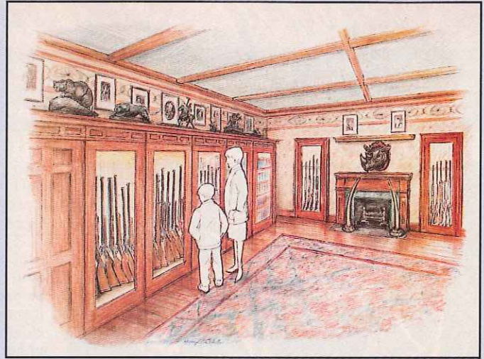
A replica of Theodore Roosevelt's library at Sagamore Hill, Long Island, New York, will be featured as the "Age of Elegance Gallery" in the new museum. The gallery will highlight safari-grade rifles and shotguns, including two of President Roosevelt's own firearms.

Opening soon, NRA's National Firearms Museum will trace American history through its arms and artifacts and pay lasting tribute to the feats and fame of shooters and hunters.