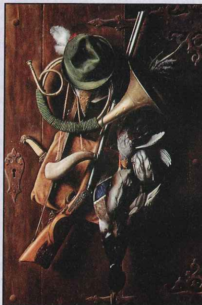
After the Hunt by William Harnett evokes hunts of the 19th century, when pursuit of game was not only a great challenge but also necessary to stock the larders of many families. A similar jaeger rifle from the museum collection (above right) is of early American manufacture and represents developments in hunting arms made by colonists and later immigrants who adapted technology from their homeland to conditions here in the United States. ( Huntington Art Museum )

When museum construction is completed and this unique archive—located within NRA Headquarters at Fairfax,